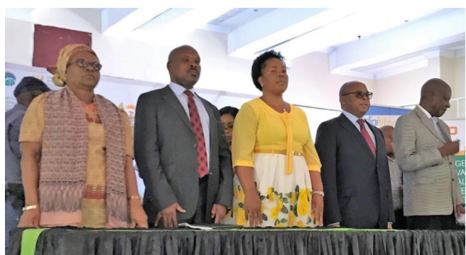
Hosi N'wamitwa, Mayor Maripe Mangena, Executive Mayor Nkakareng Rakgoale (Mopani District), Cassel Mathale (Deputy Minister for Small Business Development) and Mr Shilubane (Muhlava Royal Council) during the Youth Imbizo at Tivumbeni MPC on 23 April 2018.