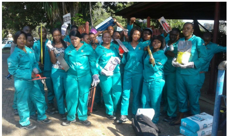
This is a group of young people undergoing theoretical and practical training on tiling.

Dankies, in cooperation with various government sections and the private sector we are currently training at least 130 young people from across our 35 wards, sixty(60)of these young men and women are being trained in retail in partnership with Mr Price group. Others are being trained on waste management, others in tiling, cookery, code 14 driver's license, welding and poultry farming. It doesn't end there Dankies, the municipality contrary to popular belief provides a platform for hundreds of young people to undergo experiential learning in various fields either