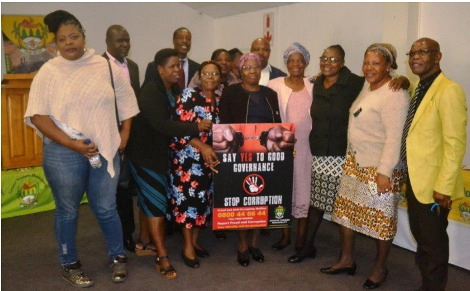
Mayor Councillor Maripe Mangena with fellow councillors during the launch of the Anti-fraud and corruption hotline at Tzaneen Country Lodge on the 8th of June 2018.

Mayor Maripe Mangena has launched a toll free anti-corruption and fraud hotline to boost the municipality's efforts to root out corruption and fraud in the municipality.